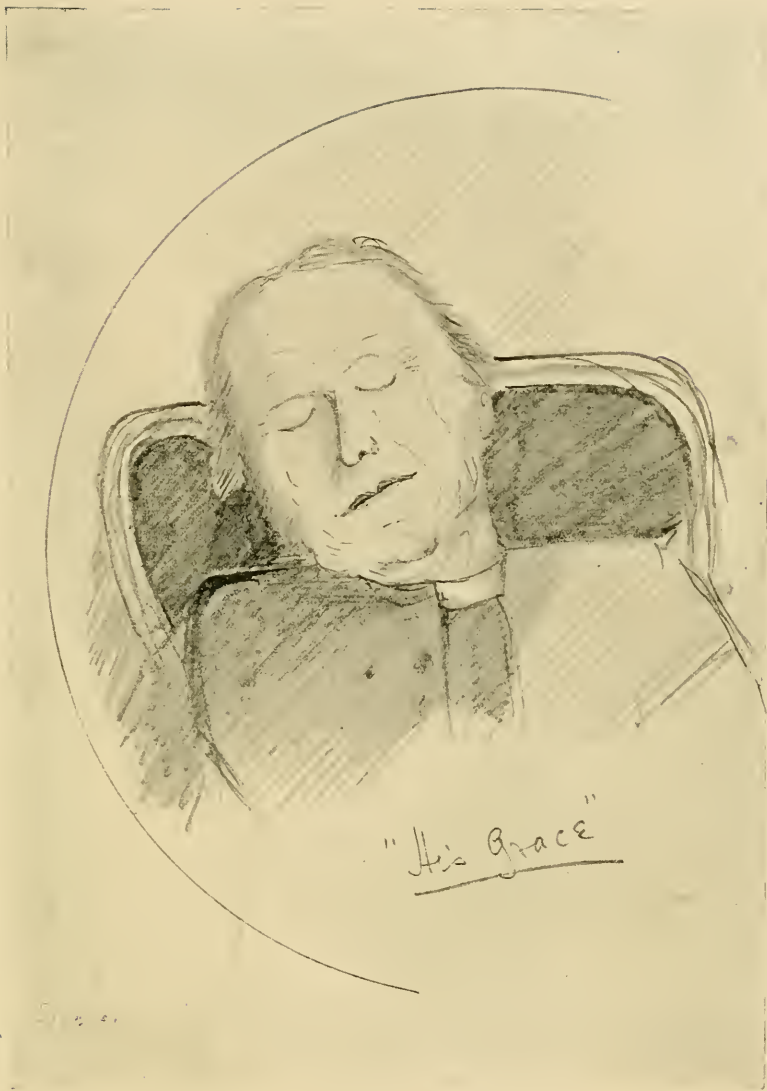
"HIS GRACE" (A DOMESTIC CARICATURE)